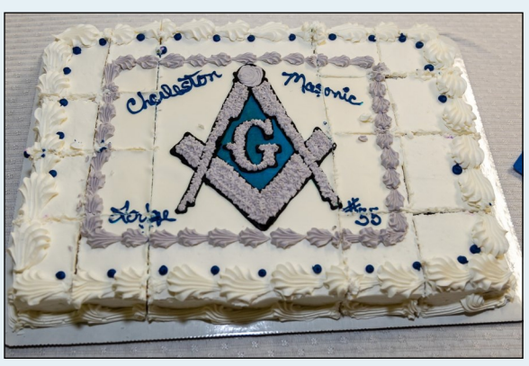
A delicious sheet cake, decorated with the square and compasses, was just some of the wonderful desserts served after the Installation of Officers.